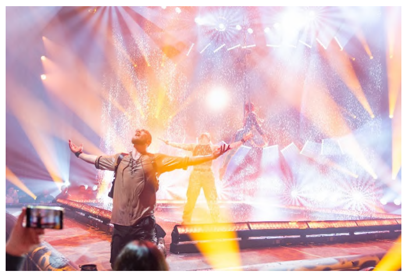
Spectacular live showcases allow visitors to experience technical innovations up close.

The Main Stage in Hall 11, where top keynote speakers will discuss current industry topics, has been redesigned with sustainability in mind. With the "Urban Garden" project, the Future Hub will also focus on the topic of sustainability. The area, which is also located in Hall 11, will focus in particular on the promotion of young talent. Educational institutions with event study courses, companies with vacant positions and start-ups will present themselves. In addition, the Future Talents Day 2024 on Friday, 22 March, invites young professionals to learn more about career opportunities in the event industry and to network. The Prolight + Sound Conference, which is being organised in cooperation with the VPLT e.V. (Association of Media and Event Technology), also offers first-hand specialist know-how.